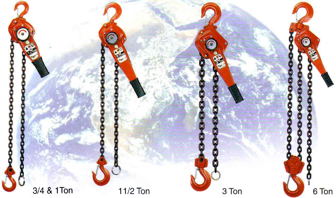
3/4 & 1Ton